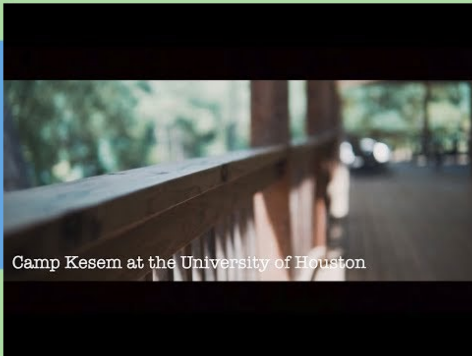
Camp Kesem at the University of Houston