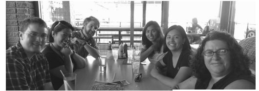
Back-to-School Dinner at Bernie's Burger Bus (8-14-14)