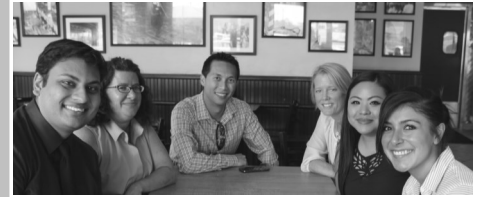
Dress for Success Lunch with Student Teachers at Jason's Deli (8-19-14)

Crespo * Cunningham * De Zavala * Foster * Garden Oaks * Herrera * Lantrip * Lockhart * MacGregor * Park Place * Rucker * Tinsley * Valley West * Wainwright * Whidby