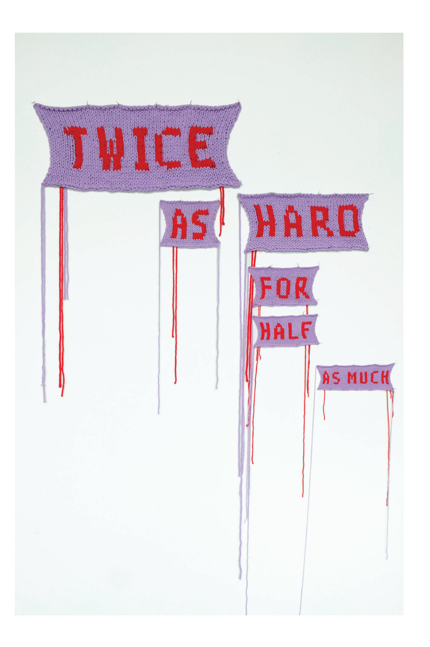
Women at Work, 2022 Acrylic yarn and blocking pins Variable dimensions

The repetitive labor of knitting is transformative for both maker and viewer. The process is cathartic and communal, allowing for collaborative narratives across time and space. I believe that fiber is elemental, exists within us, and tells the story of our shared experiences. Through knitting I use my own labor to make visible the work of others—a reminder of the ties that bind us all together.