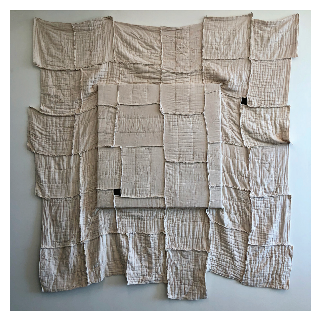
Co-emergence, 2020 Diapers and felt on wooden stretcher 85 \times 85 inches

Through repetition, rearrangement, and reinvention, I'm exploring the dichotomy between parenthood and individualism, as well as the tension between the need for responsibility and the desire for rebellion. My practice is a conjuring of the internal processes that are imperative in severing old identities so as to create space for new understandings. The resulting body of work centers around questions of gendered labor, feminist mother identity, and self-manifestation.