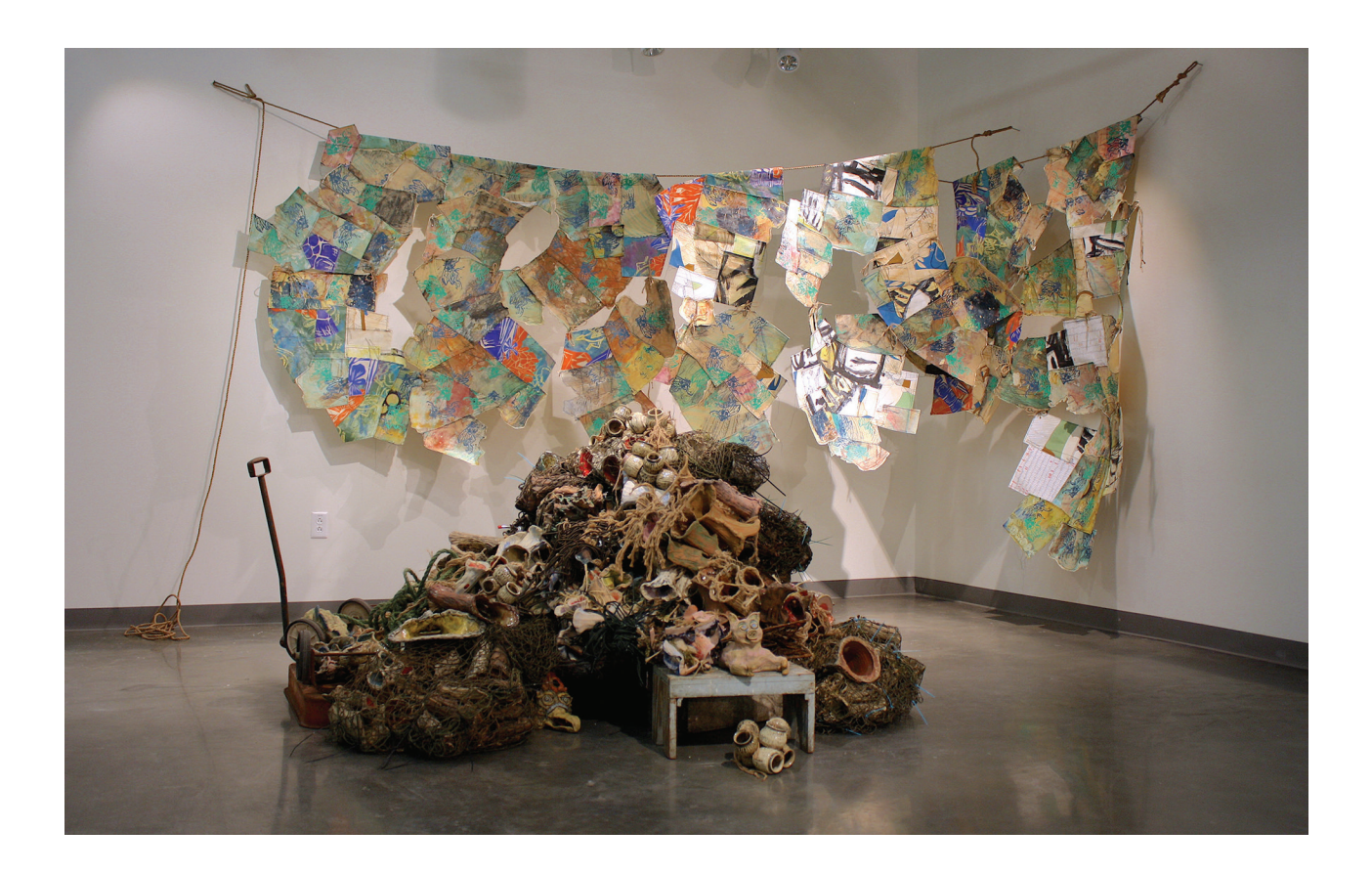
Piles and Bundles, 2022 Ceramics, ropes and jute, zip ties, weathered metal wagons and springs, wood, paint, screen prints, wood cuts, paper, ink, coffee, and sewing thread 10 \times 10 \times 8 feet

I stage situations in which stories take place. These narratives are influenced by nostalgic references to life living in tropical and wild areas of the Southern United States. The sculptures become theatrical props, set up playfully to engage the viewer and invite them into the story. My practice uses small individual characters that are physically tied together, sewn, or collaged to create large layers of bundles. The bundles represent the fullness or mischief that is possible when single living beings settle into larger groups. The structures are created from a mixture of found materials; obtained from roadsides, construction zones, and sentimental locations, these objects are combined with handmade elements like wood cuts, screen prints, ceramics, plants, paper, fabric, house paints and ropes. When exhibited, the sculptures are never shown the same twice. They are forever morphing into new piles and arrangements; creating environments for new tales and moments to be born.