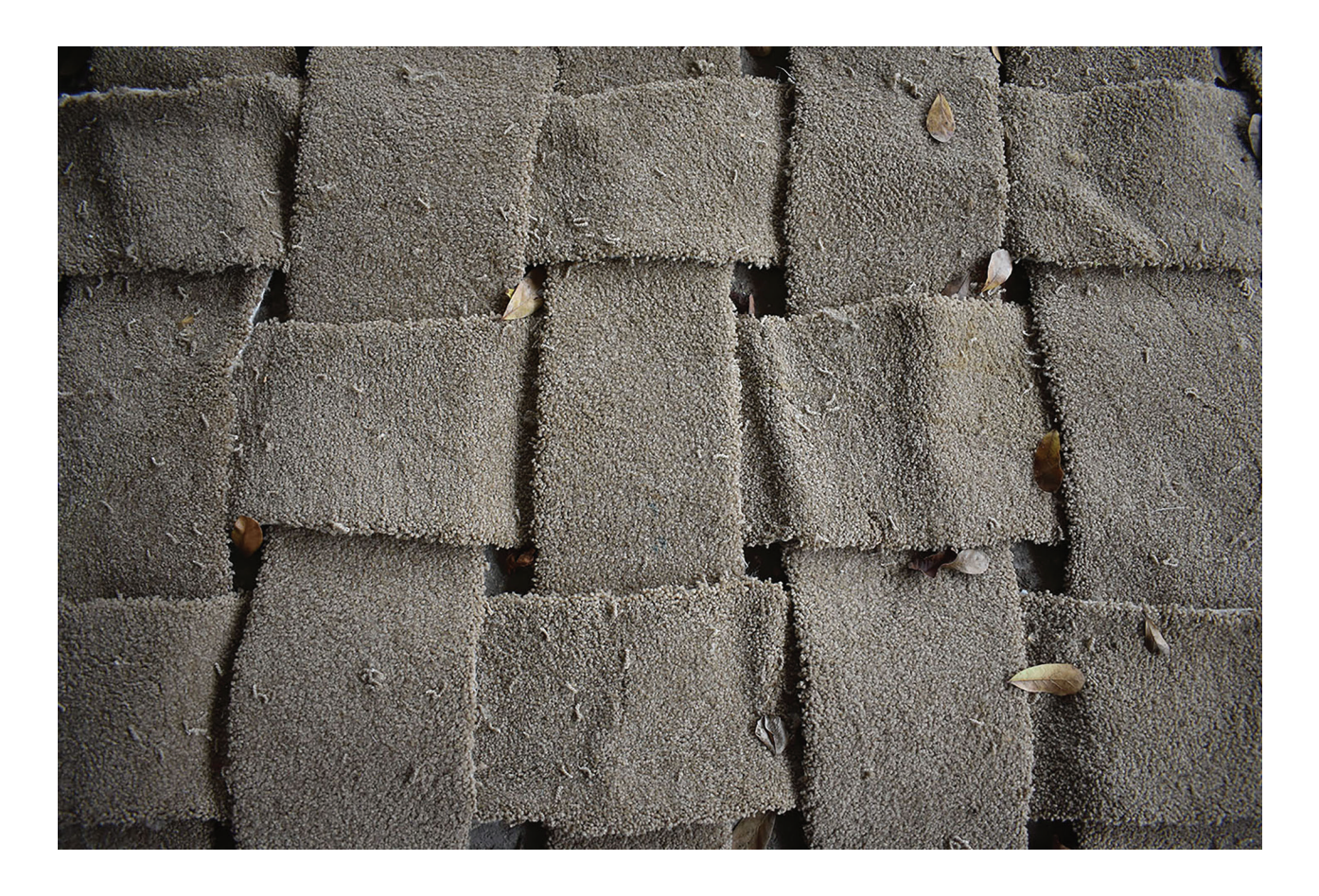
A Weaving Carpet (detail), 2018, 2022 Found carpet Variable dimensions