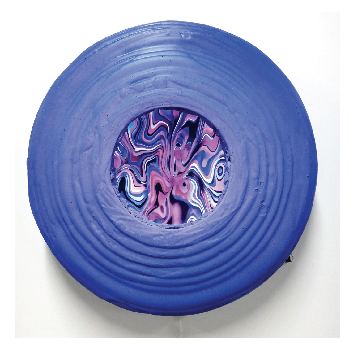
Processing the Body, 2022 Wooden frame, latex, foam, spray paint, looped video on embedded monitor 25 \times 25 inches

Technology is an extension of our hands and minds. I utilize it to elicit haptic experiences that create tension between the human body and the virtual world. Ultimately, the work highlights the nature of an evolving humanity, while realizing the limitations of integration that still exist. I invite people to use their bodies to interact with and control technology, as they collaborate to conjure a work of art. Coding and sensors make this sort of interactivity possible. The physical materials I use represent the human form, while the digital materials allude to our inner selves.