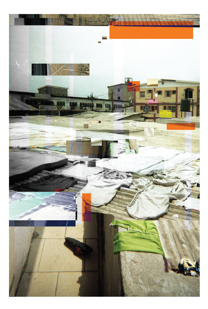
Unititled , 2022 Inkjet print 12 × 18 inches

My work is an autobiography of my journey as a migrant child. I immigrated from Cameroon to France at the age of six. Subsequently, my family moved to Louisiana, where I often felt the francophone connection to my birth country. The distortion and confusion surrounding my family's immigration journey created a need to investigate my history further. I always found it unfair that the journey of the immigrant parent is acknowledged while the journey of the immigrant child is unaccountable. My practice explores my inner thoughts and emotions attributed to displacement. Therefore, I use my experience as an adult to revisit what was lost in my cultural transition using photography and interdisciplinary techniques to touch on issues of identity. In my work, recollection of lost memories is explored through family archives and oral stories once told by elders.