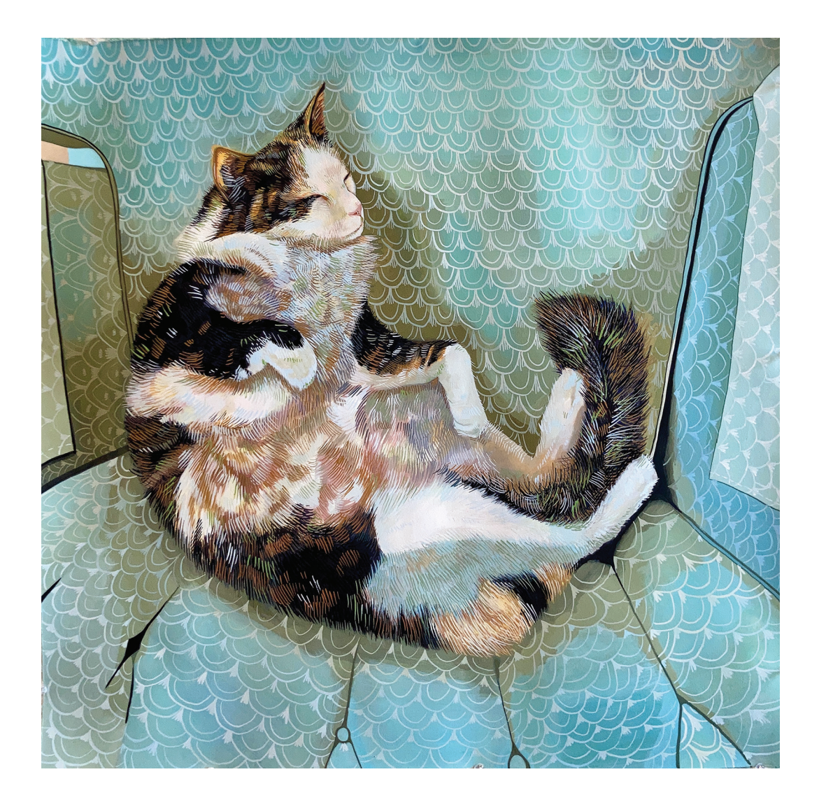
Cat's Cradle, 2021 Gouache on paper 25 \times 26 \frac{1}{2} inches