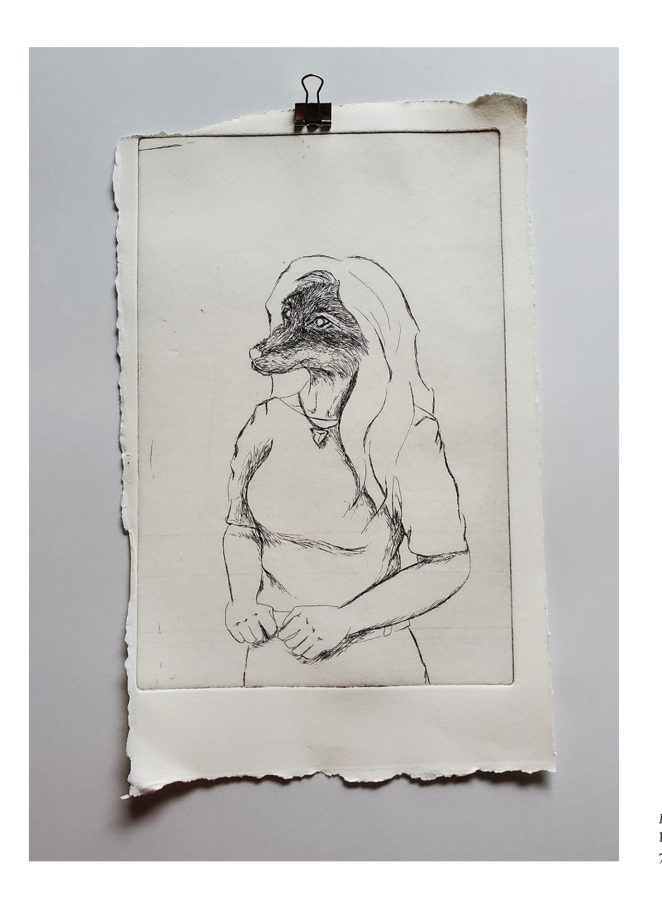
Es Una Zorra (She's a Fox), 2020 Etching on paper 7 × 11 inches

Whatever the reaction may be, I want the viewer to make a connection with the work or the information, or even wonder why there was an emotional shift with this encounter. Depending on when you find us, me and my work, we may look different; you may see words, pictures, illustrations, videos, or different objects; however, you find us, that sincere reaction is what we look to inspire.