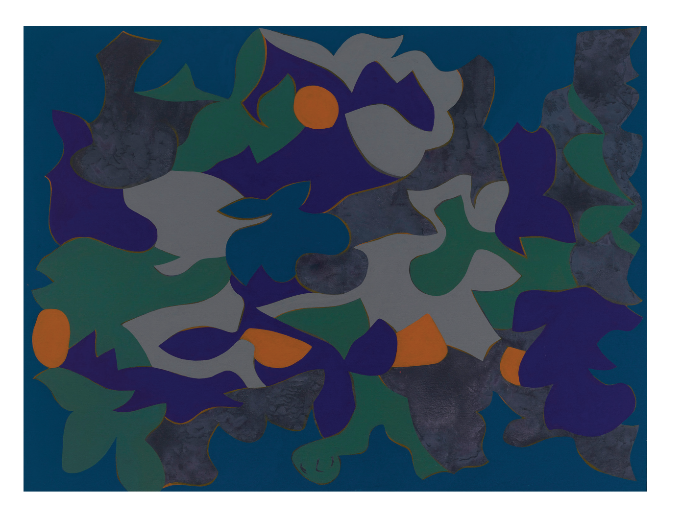
Don't Go Dark, 2021 House paint on canvas 36 × 48 inches Private collection

Ultimately, I seek harmony and balance in the interaction of these elements. This search for synergy is mirrored in my life, but I am secure on my Life Raft , for now.