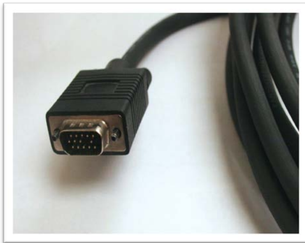
← VGA cable