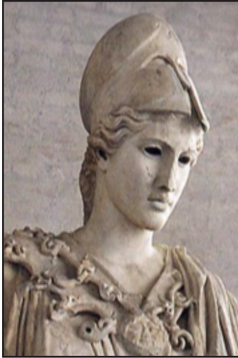
The clear-eyed goddess Athena, patron of the polis, of wisdom, and of war

P hronesis is the Greek word for prudence, or practical wisdom. Aristotle identified it as the distinctive characteristic of political leaders and citizens in adjudicating the ethical and political issues that affect their individual good and the common good.