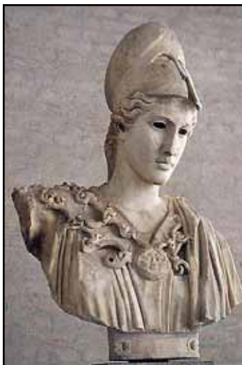
The clear-eyed goddess Athena, patron of the polis, of wisdom, and of war

An Interdisciplinary Program in Politics and Ethics Minor Housed in The Honors College