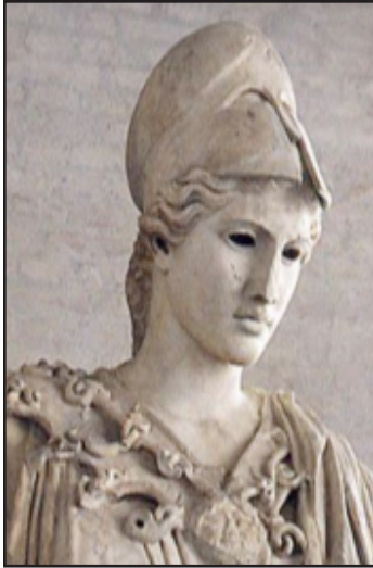
The clear-eyed goddess Athena, patron of the polis, of wisdom, and of war

Phronesis is the Greek word for prudence or practical wisdom. Aristotle identified it as the distinctive characteristic of political leaders and citizens in adjudicating the ethical and political issues that affect their individual good and the common good.