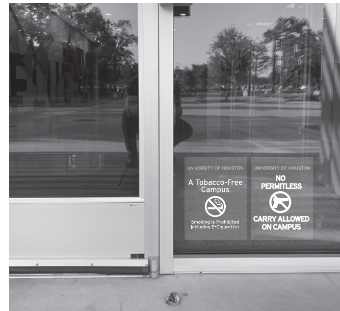
REFERENCE IMAGE - TYPICAL PLACEMENT, SINGLE MYLAR ADHESIVE