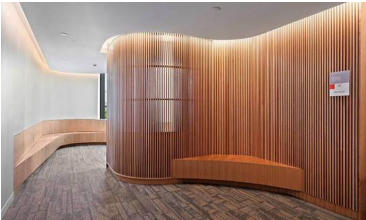
Law Center – 239 SF