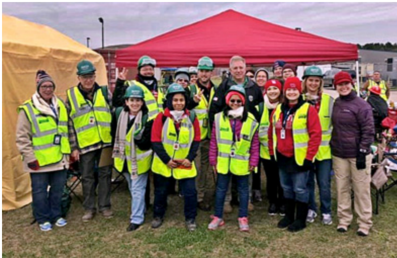
UH CERT Team at the CERT Rodeo 2019