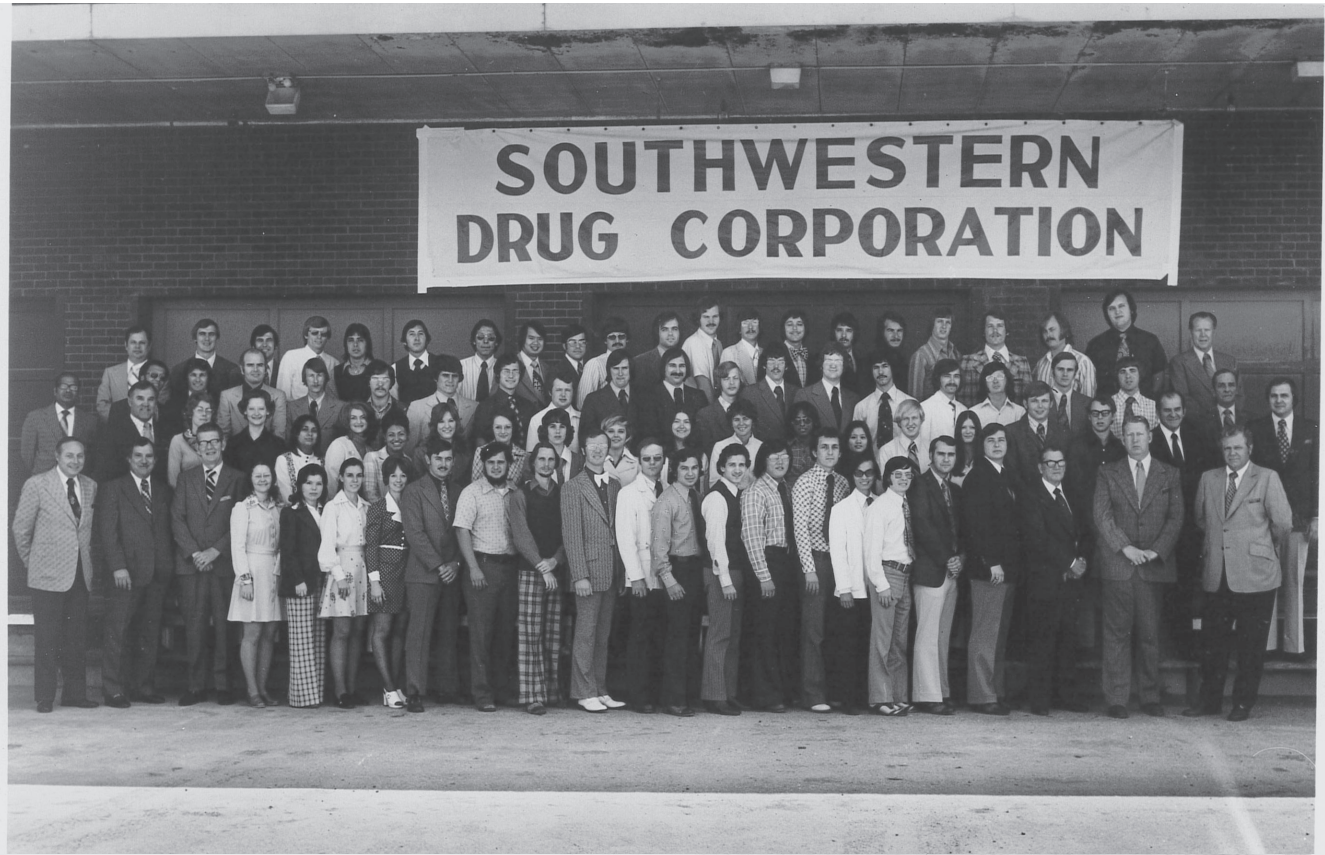
SENIOR CLASS OF 1974. COLLEGE OF PHARMACY UNIVERSITY OF HOUSTON SOUTHWESTERN DRUG CORPORATION LUNCHEON. MARCH 22, 1974

The University of Houston College of Pharmacy's faculty, staff, and students salute the Class of 1974 on the occasion of their 50th Anniversary of their Commencement.