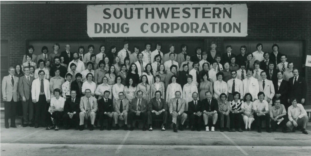
The University of Houston College of Pharmacy’s faculty, staff, and students salute the Class of 1975 on the occasion of their 50th Anniversary of their Commencement.