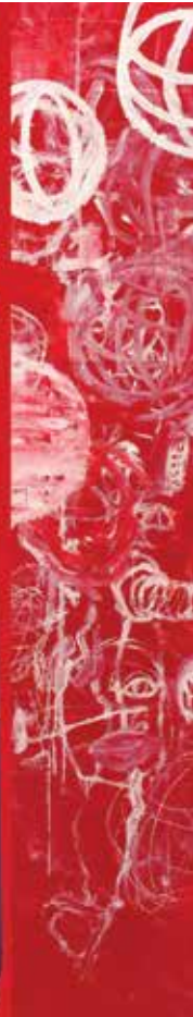
Table Talk benefits the Women's, Gender & Sexuality Studies Program and the Carey C. Shuart Women's Archive and Research Collection at the University of Houston. The Shuart Women's Archive collects, preserves and shares the stories of women's contributions to Texas and Houston. The WGSS Program combines theoretical and empirical studies, to give students the tools to analyze the gender dynamics of the past and present and to build a fair future.

Table Talk is a fascinating combination of conversations over lunch, led by dynamic women of various cultures, professions and experience at each table.