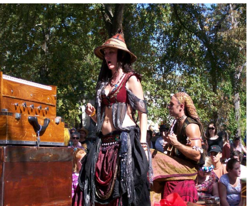
Voices Fall 09

I took a lot of pictures with the new camera given me by my mother. Unfortunately, after some time, I lost my camera. I was very angry when I discovered I had lost my camera. I rechecked everywhere I had been sitting but I couldn't find it. When somebody told me that if you lost something, you could go and ask for help from the information center, I immediately went there to check. I didn't find my camera. Finally, it was getting late, and I gave up looking for my camera. Actually, I was angry, not because I lost the camera itself, but because there were a lot of pictures in it which I could show to my children and grandchildren.