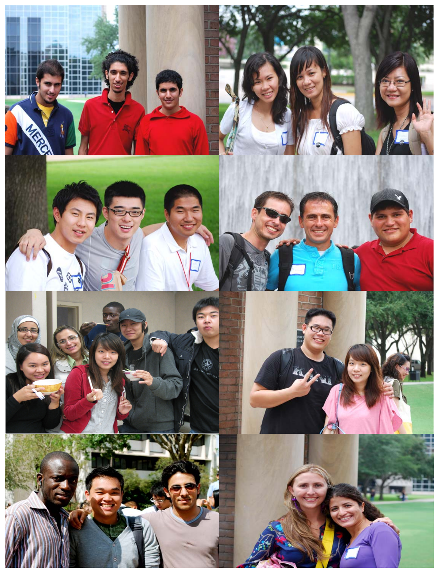
Voices Fall 09