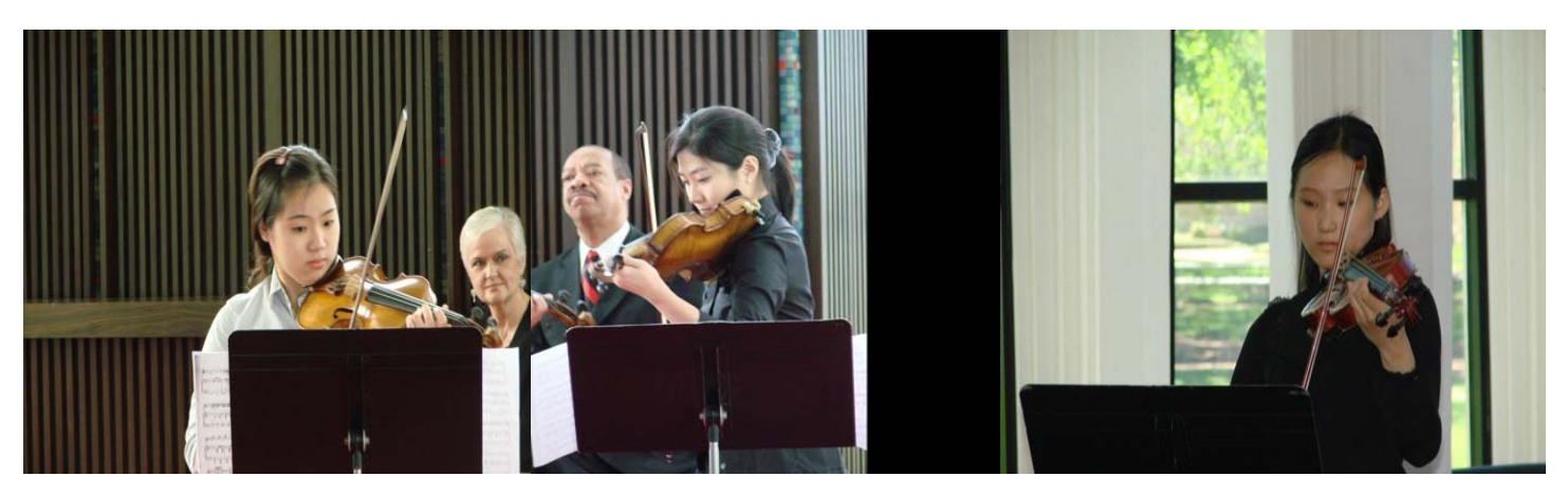
LCC students performing music at graduation ceremonies