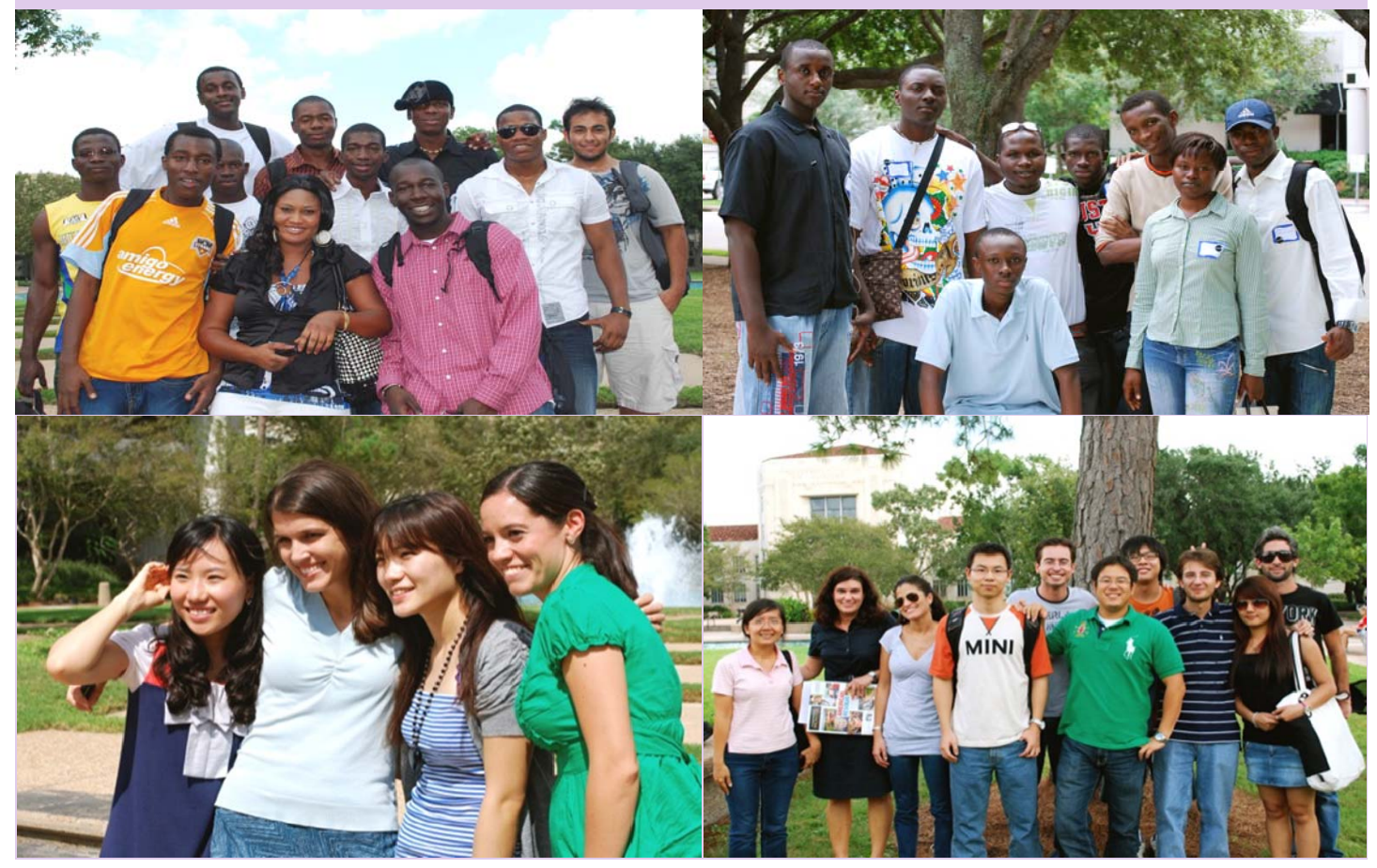
Voices Fall 09