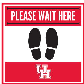
F9 Floor Decal 8", 12" Square