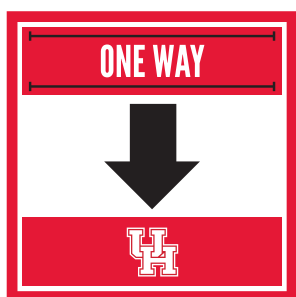
F12 Floor Decal 8", 12" Square