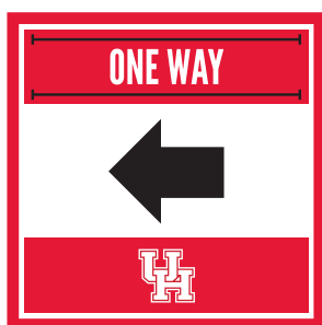
F13 Floor Decal 8", 12" Square