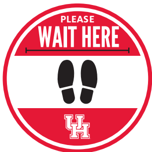
F8 Floor Decal 8", 12" Diameter