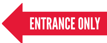
F5 Floor Decal 30 x 11"