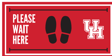
F10 Floor Decal 8 x 4"