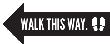
F4 Floor Decal 30 x 11"