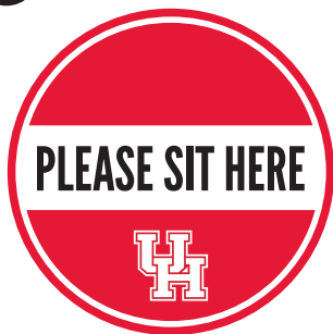
F1 Chair/Table Decal 3 x 3"