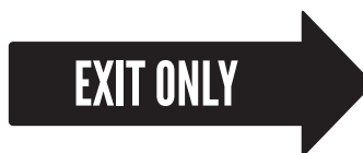
F6 Floor Decal 30 X 11"