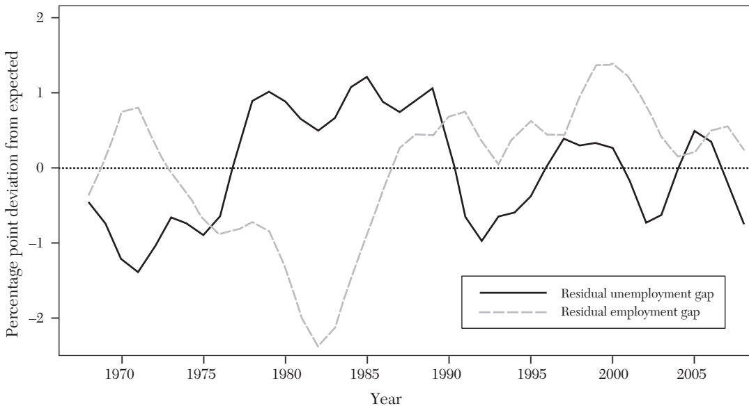
Figure 2. Adjusted Employment/Population and Unemployment Gap: Black versus White Men, 1968–2008

Perhaps most importantly, in 1982 and 2007 (admittedly a trough and a peak), the employment-to-population ratio of white men was 73.0 percent and 73.5 percent. For black men, it was 61.4 percent and 65.5 percent, and thus, even adjusting for incarceration rates, it did not drop noticeably. Even allowing for the increased incarceration of black men over this period and the lesser increase among white men, there was no strong change in the employment-to-population rate of men of either race. Yet, over the same period, there was strong wage convergence. This suggests to us that there is real wage convergence to be explained and that it is not just a result of changes in who is employed.