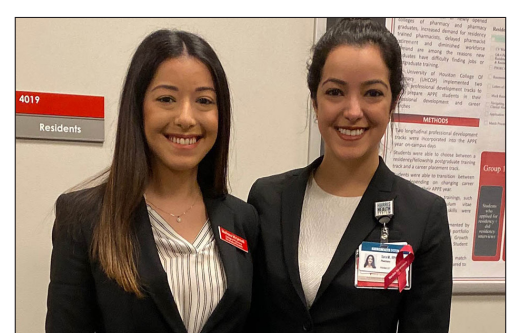
2020 and 2019, respectively.

The chapter secured a 2nd Runner-up Award in the Division AA