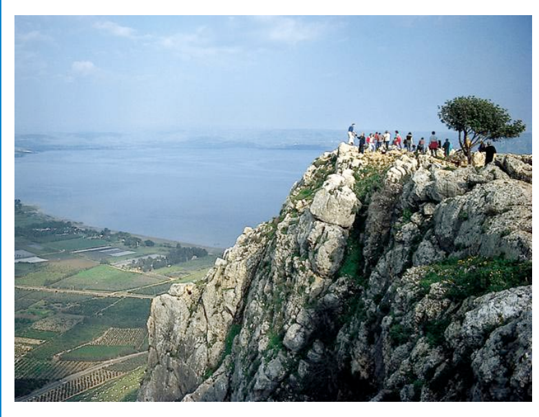
Mt. Arbel views of the Sea of Galilee

NETANYA: Seasons Hotel, TIBERIAS: Ron Beach Hotel, JERUSALEM: Gloria Hotel, ISTANBUL: Kent Hotel