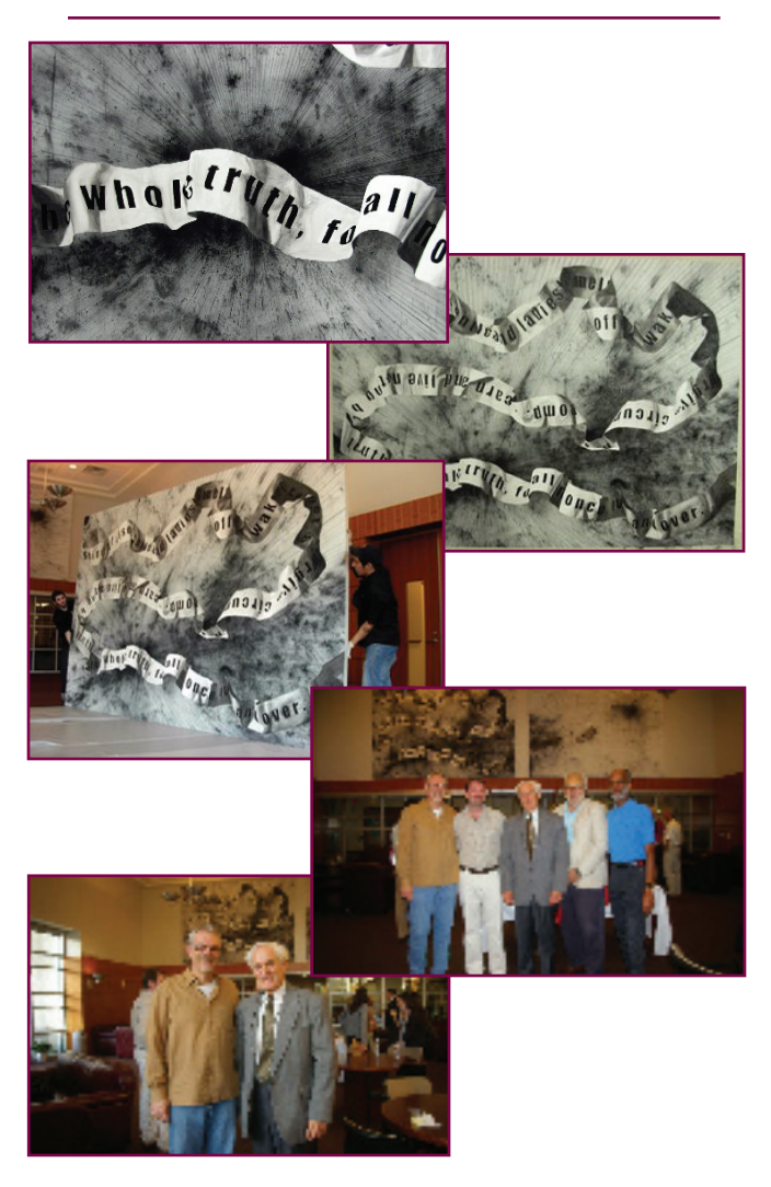
For a press release on the piece, please visit DABFOTO at www.dabfoto.com/.