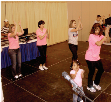
BOUNCE dances for fitness