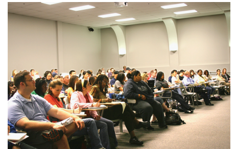
room 205 Garrison

We have substantially improved the look and feel of the Garrison/Melcher complex. Many classrooms have been enlarged, painted, equipped with computers in the desks, and contain modern audio/visual equipment to enhance learning. The hallways have been painted and there are posters on display about our faculty members, people engaged in physical activity, scientific presentations and general information. A student lounge was also added within the last year and a half to provide students with a place to gather.