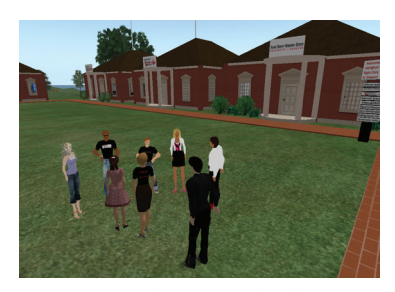
Scene from Second Life

Another exciting development is HHP's venture into the 3-D immersive world of Second Life. Second Life enables your avatar (your digital representative) to navigate buildings and parks, attend concerts, chat, spend and earn Linden dollars (Second Life's own currency) and take education courses just like you would in real life. The university recently funded several HHP professors to develop courses that will be delivered through the Second Life medium. We have also been awarded funding from the Second Life and Public Good Community Challenge to promote obesity literacy. This project is being sponsored by our Texas Obesity Research Center. We have already built a virtual campus,