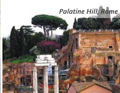
Palatine Hill, Rome