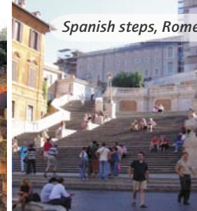
Spanish steps, Rome