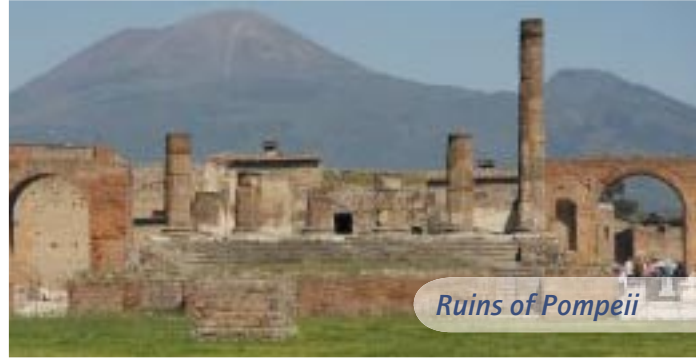
Ruins of Pompeii