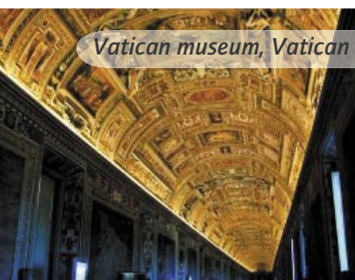
Vatican museum, Vatican

Itinerary is subject to change depending on availability.