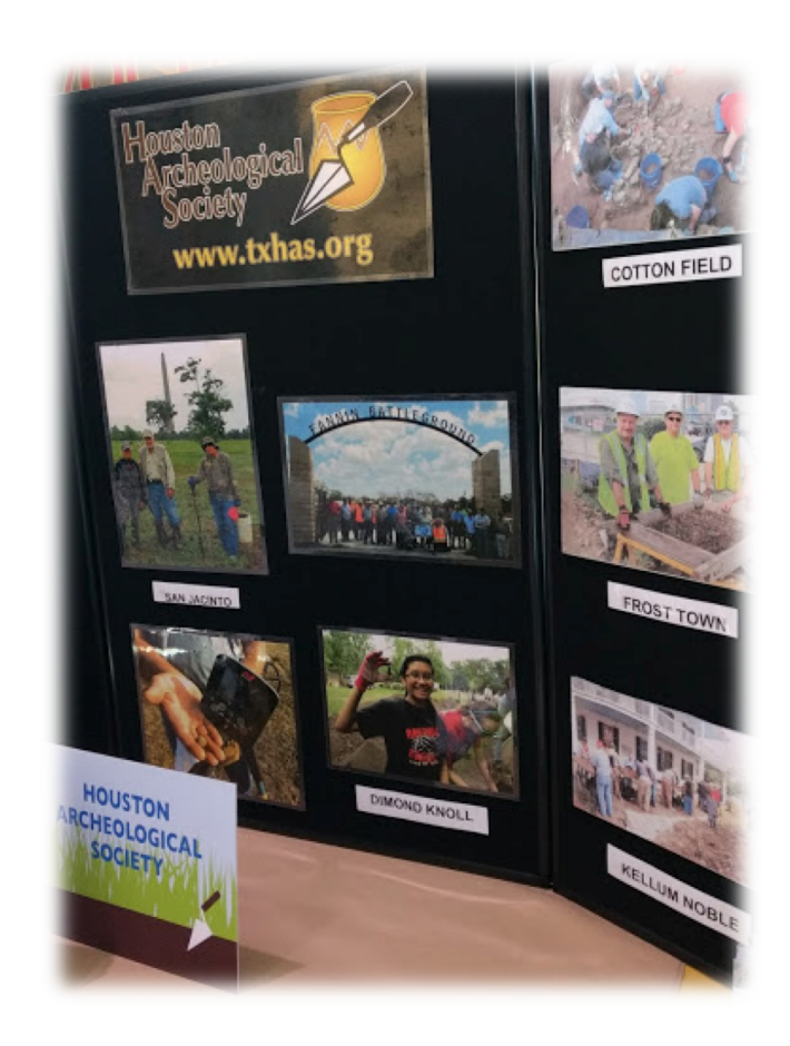
Some recent projects by TxDot & Houston Archaeological Society