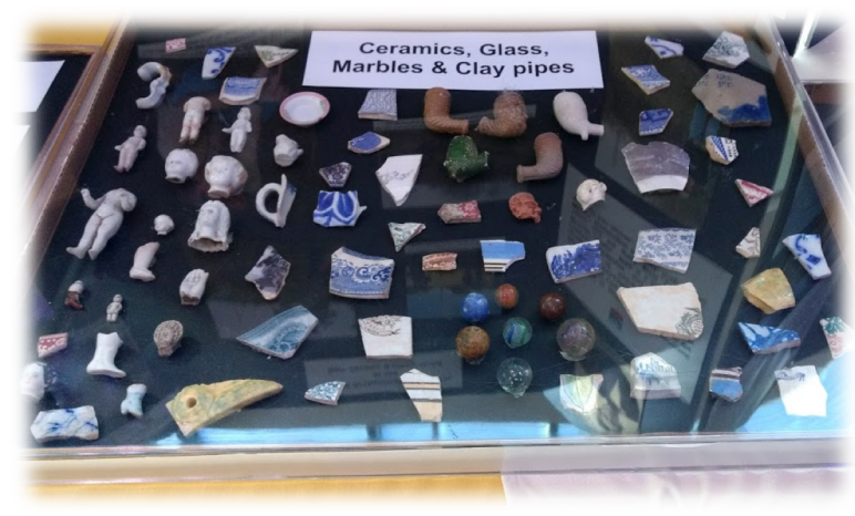
Assorted artifacts from Frost Town excavation (Houston Archaeological Society & TxDot)

October is Archaeology Month, and October 28<sup>th</sup> is International Archaeology day. The Houston Museum of Natural Science hosted a celebration highlighting local archaeology groups in the Houston area include the Texas Archaeological Society, the Houston Archaeological Society, and TxDot to name a few participating organizations. This is a great event for those interested in local and historical archaeology, and many participating groups also have volunteer opportunities for students!