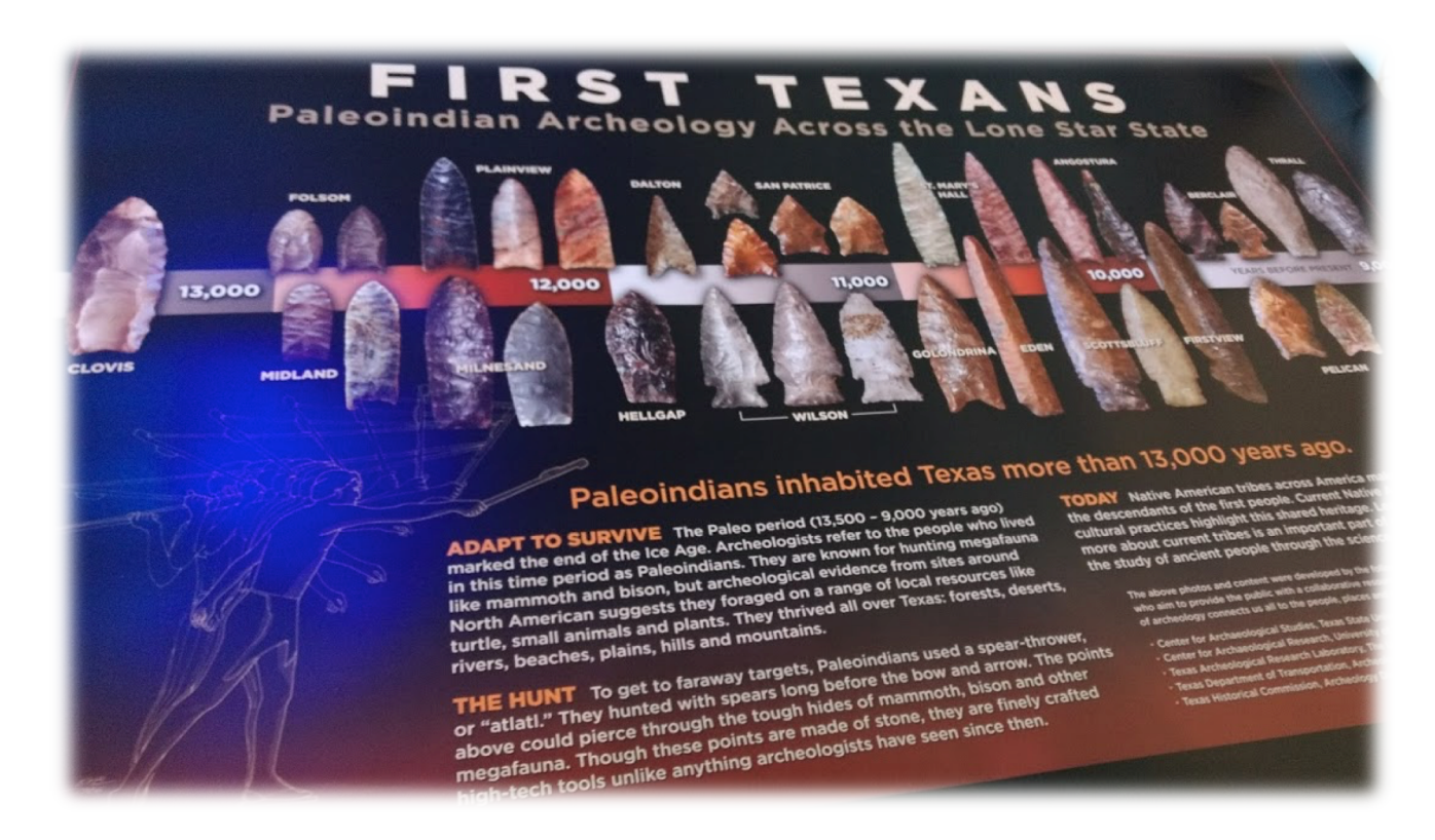
Poster of Paleoindian lithics by TxDot. Check it out on the Anth Department posting board!