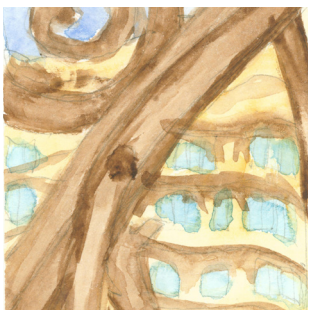
*Watercolor work from students in the Study Abroad program