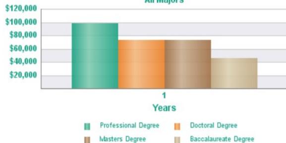
Three Most Popular Programs Total